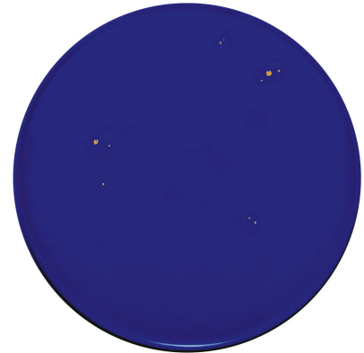
With Microban® Protection

*This information is based upon standard laboratory tests and is provided for comparative purposes to substantiate antimicrobial activity for non-public health applications. Microban technology is not designed to protect users from disease causing microorganisms. Microban protection inhibits the growth of microorganisms that cause stains, odors, and product degradation. Antimicrobial action limited to product surface.