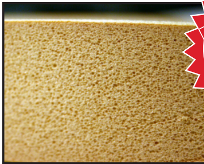
RESILITE Rubber Nitrile Foam